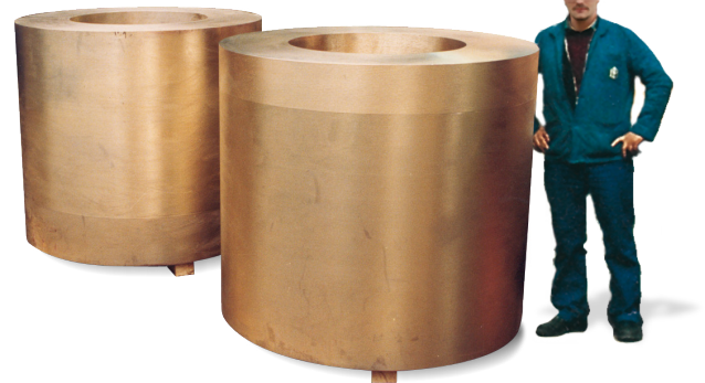
WIPER ROLLERS FOR COLD ROLLING OF ALUMINIUM AND STAINLESS STEEL Material : Aluminium-bronze with high hardness