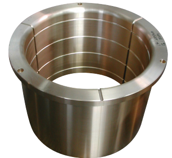
POURING LADLE BUSHES Material : High Tensile Brass