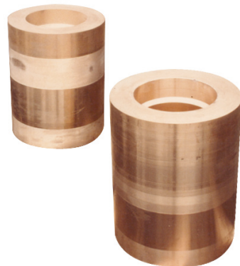
ROUGH MACHINED SCREW DOWN NUTS Material : High tensile brass, bronze, aluminium bronze